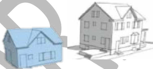
Example of Detached ADU.

C. “Detached accessory dwelling unit” means an accessory dwelling unit that consists of a building that is separate and detached from the primary single-family housing unit. Examples include converted garages or new standalone construction.